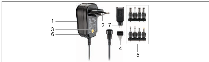
Tab.3: Operating elements and parts